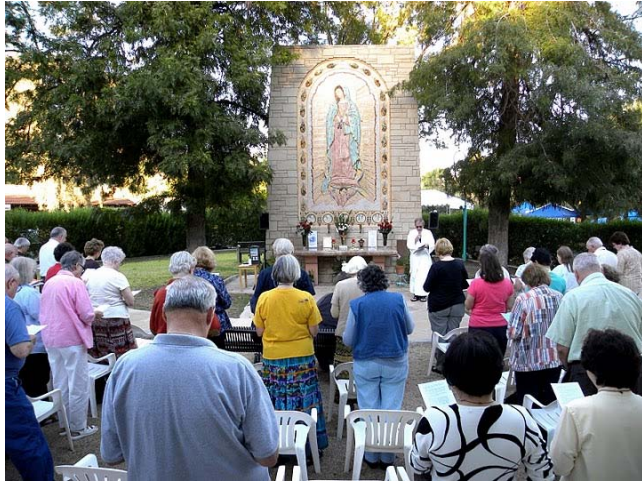
Memorial Service at the Guadalupe Shrine